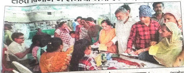
कैंप के दौरान मरीजों की जांच करते हुए डाक्टर।