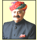
Sh. V.P. Singh Badnore Hon'ble Governor, Punjab Our President