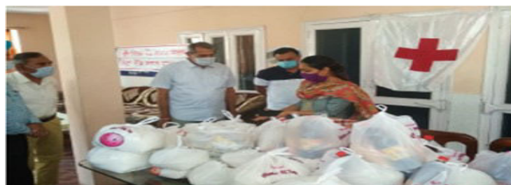
Deputy Commissioner cum President, District Red Cross Branch, Roopnagar distributed kits to the inhabitants of Apna Ghar at Haveli Kala, Roopnagar and paid tribute to Sir Jean Henry Dunant.

10 ration kits, 10 spray pumps filled with sanitizer and 100 face masks were provided in district Bathinda. A blood donation camp was also organized in which 50 blood units were collected. This camp was dedicated to the Founder of International Red Cross Society.