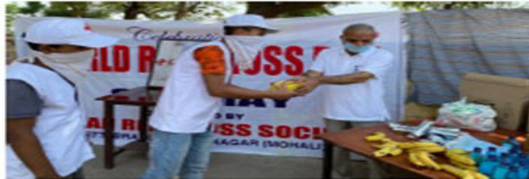
The District Red Cross Branch, S.A.S. Nagar distributed milk packets, fruits, biscuits, sanitizers, masks and fruits to the children Home, Dusema, Kurali, S.A.S. Nagar under the able guidance of Deputy Commissioner cum President, DRCS, Mohali.