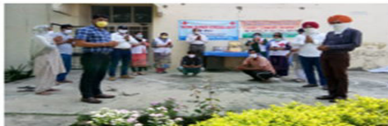
Project Director DDC, Patiala and other staff members paid tributes to Sir Jean Henry Dunant, the founder of Red Cross and distributed masks to OPD patients of Saket Hospital, Patiala.