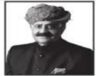
V.P. Singh Badnore Governor of Punjab and Administrator Union Territory, Chandigarh