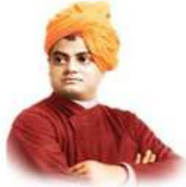
SWAMI VIVEKANANDA JI (दुखी, दरिद्र और दलितों के मसीह)