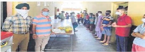
ਚਿਲਡਰਨ ਹੋਮ ਕੋਅਰ ਦੁਸਾਰਨਾ (ਕੁਰਾਲੀ) ਵਿਖੇ ਬੱਚਿਆਂ ਨੂੰ ਮਾਸਕ, ਸੈਨੇਟਾਈਜ਼ਰ ਤੇ ਸਾਬਣ ਸਮੇਤ ਫਲ ਵੰਡਦੇ ਹੋਏ ਜ਼ਿਲ੍ਹਾ ਰੈੱਡ ਕਰਾਸ ਸ਼ਾਖਾ ਦੇ ਨੁਮਾਇੰਦੇ।