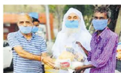
ਮੁਹਾਲੀ ਵਿਖੇ ਰਿਕਸ਼ਾ ਚਾਲਕਾਂ ਤੇ ਸਟਾਈਲ ਮੋਡਰਨਾਂ ਨੂੰ ਰਸ਼ਨ ਤੇ ਕਰਾਸ ਸ਼ਾਖਾ ਦੇ ਨੁਮਾਇੰਦੇ।