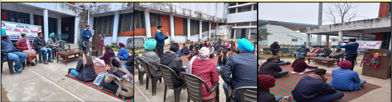
Awareness lecture on First Aid imparted to the volunteers of NSS department of Govt College, Gurdaspur.