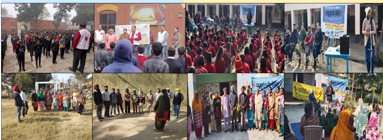
Awareness Drive By Drug De-addiction Centre Gurdaspur at Govt. Senior Sec School Gurdaspur.

The land of Punjab has always given birth to brave warriors, but some people are putting the youth on the path of drugs for their own benefits and endangering the future of Punjab. We should be aware of such people and be careful to avoid this bad swamp of drugs. To spread this message, the Punjab Red Cross De-addiction Centres namely Khanpur, Nawasheher, Patiala and Khanpur have organised awareness lectures at different locations. Such awareness campaigns not only help to aware the society, but also motivate the drug addicts to get rid of this bad habit, the addicts also come to know about rehabilitation centres where they can be treated free of cost. Through these campaigns many individuals have approached our rehabilitation centres and are treated well on time. These individuals motivates the other individuals outside who are still struggling with this habit.