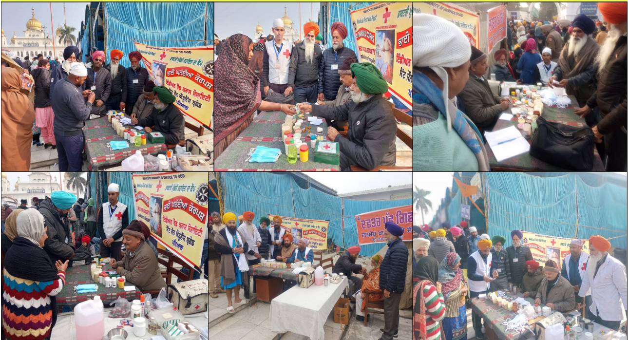
First Aid posts established at Gurudwara Shri Fatehgarh Sahib on the evening of Shaheedi Jord Mela-2022 by Punjab Red Cross, St. John Brigade Patiala Branch. Free checkups of the patients was done and free medicines were given.