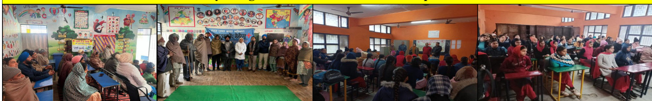
Awareness Drive By Drug De-addiction Centre Nawasheher at village Jalalpur (Balachour)