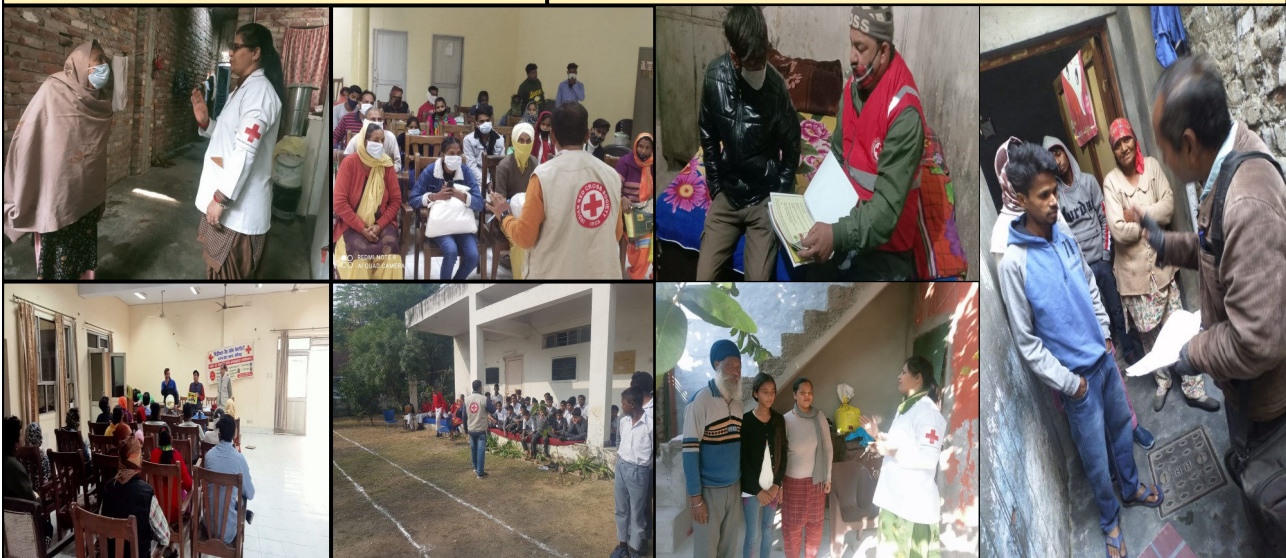
225 Ration kits distributed to Tuberculosis Patients by Jalandhar