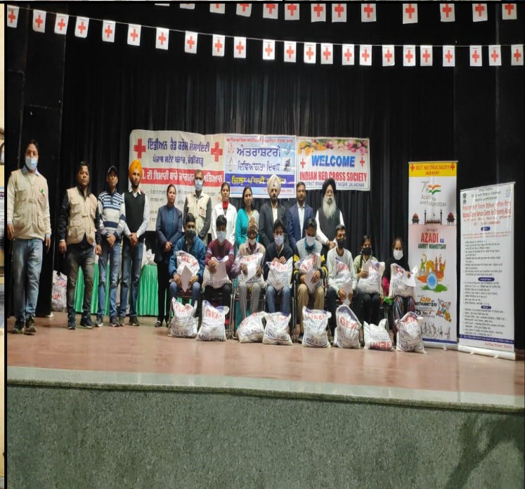
Ration kits distributed to Tuberculosis Patients.