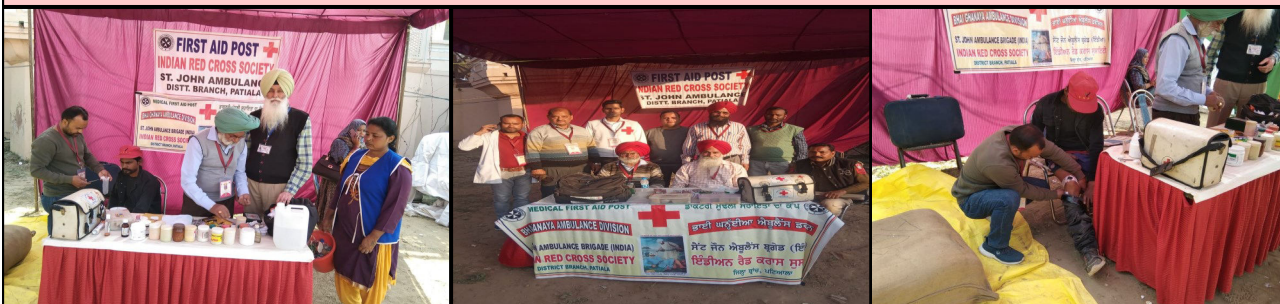
First Aid Post established by St. John Ambulance, Patiala at Sheesh mehal on the eve of Sharash & Craft Mela .