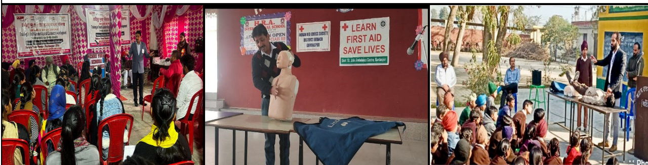
Glimpses of the Awareness Lecture on First Aid by the Punjab Red Cross Gurdaspur and Bathinda Branch.