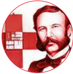
Sir Jean Henry Dunant