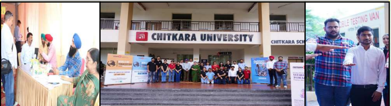
WORLD NO TOBACCO AWARENESS CAMPAIGN HELD AT CHITKARA UNIVERSITY CAMPUS