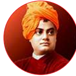
Swami Vivekananda Ji