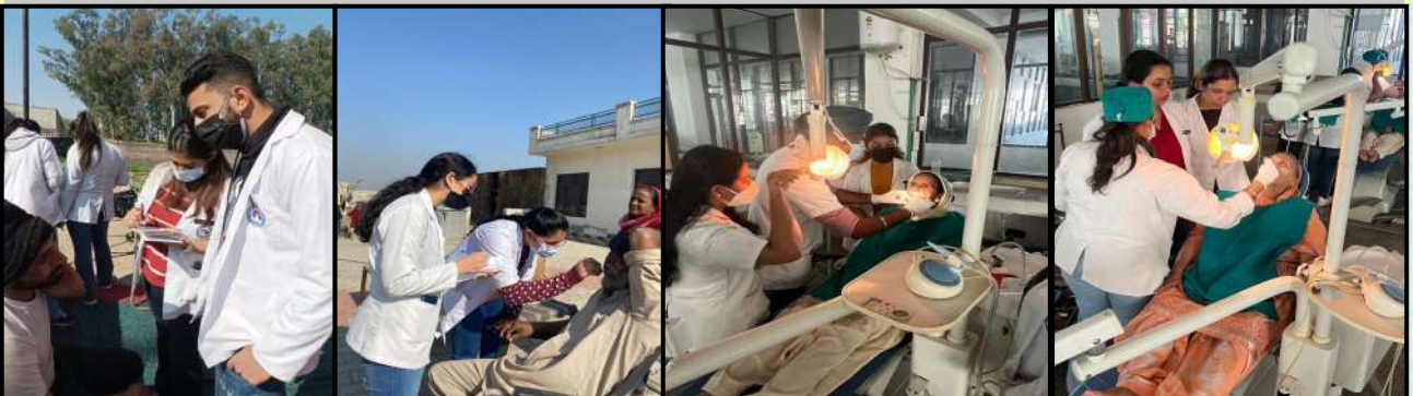
WORLD NO TOBACCO AWARENESS CAMPAIGN HELD AT RAYAT-BAHRA UNIVERSITY AND RADIALA VILLAGE KHARAR