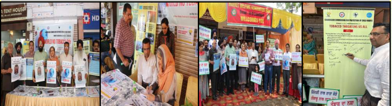
WORLD NO TOBACCO AWARENESS CAMPAIGN HELD AT SEC-44 D MARKET, CHANDIGARH