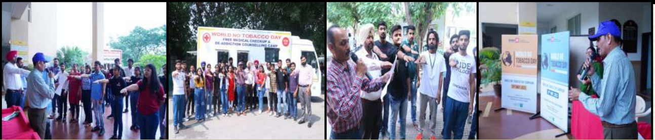
WORLD NO TOBACCO AWARENESS CAMPAIGN HELD AT CHANDIGARH UNIVERSITY CAMPUS