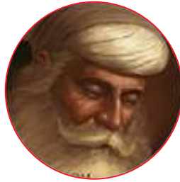
Bhai Ghanaiya Ji